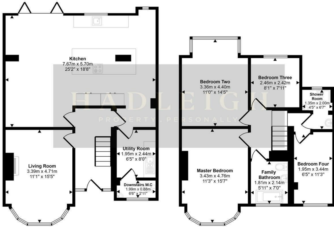
Ground Floor Approx 74 sq m / 795 sq ft

Approx Gross Internal Area 131 sq m / 1413 sq ft